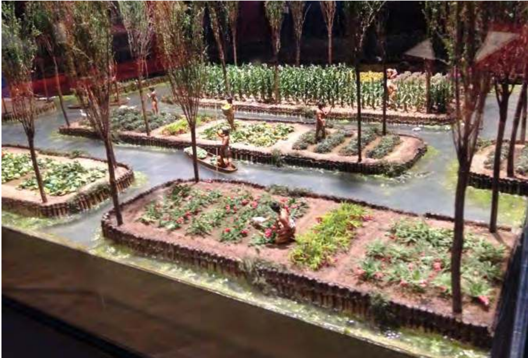
Model of Chinampas on display at the Aztecs Exhibition, Melbourne Museum, July 2014